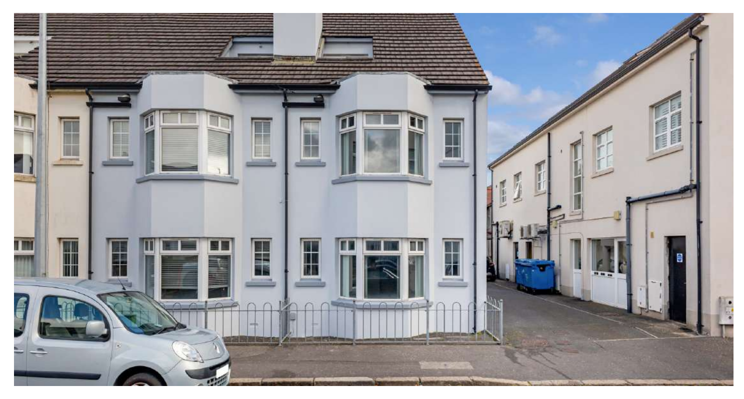
TOWNHOUSE | 3 ⊨ | 2 ≒ | 2 ⊟

Located right in the heart of the highly desirable and popular village of Ballyholme, Bangor, here is an ideal opportunity to purchase a fantastic end town house with no onward chain.