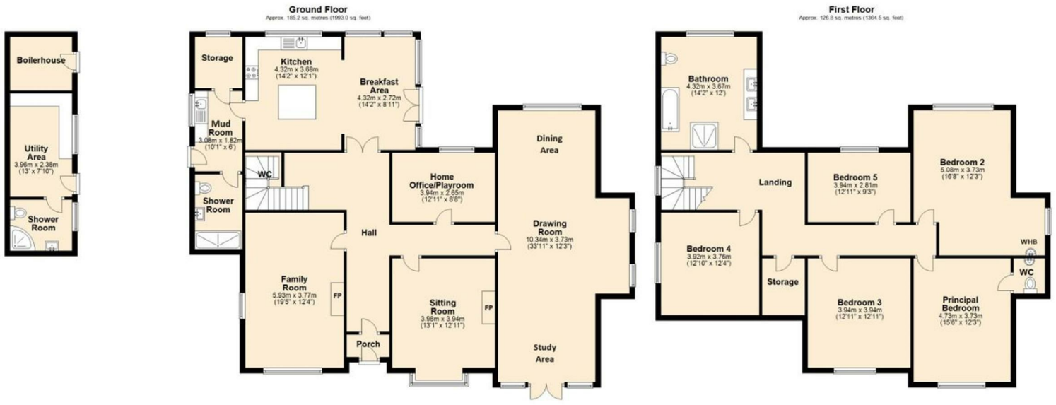
Total area: approx. 311.9 sq. metres (3357.5 sq. feet)

Mortgage advice is available from our in-house Mortgage Advisor, you can find out how much you can borrow within minutes!