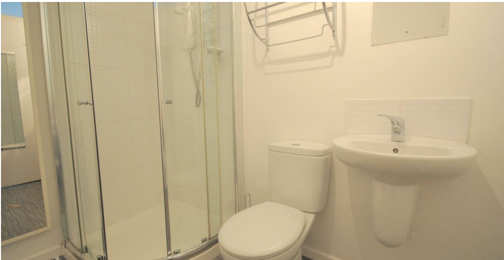
TYPE ROOM NAME HERE