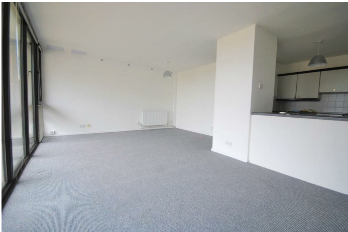
TYPE ROOM NAME HERE