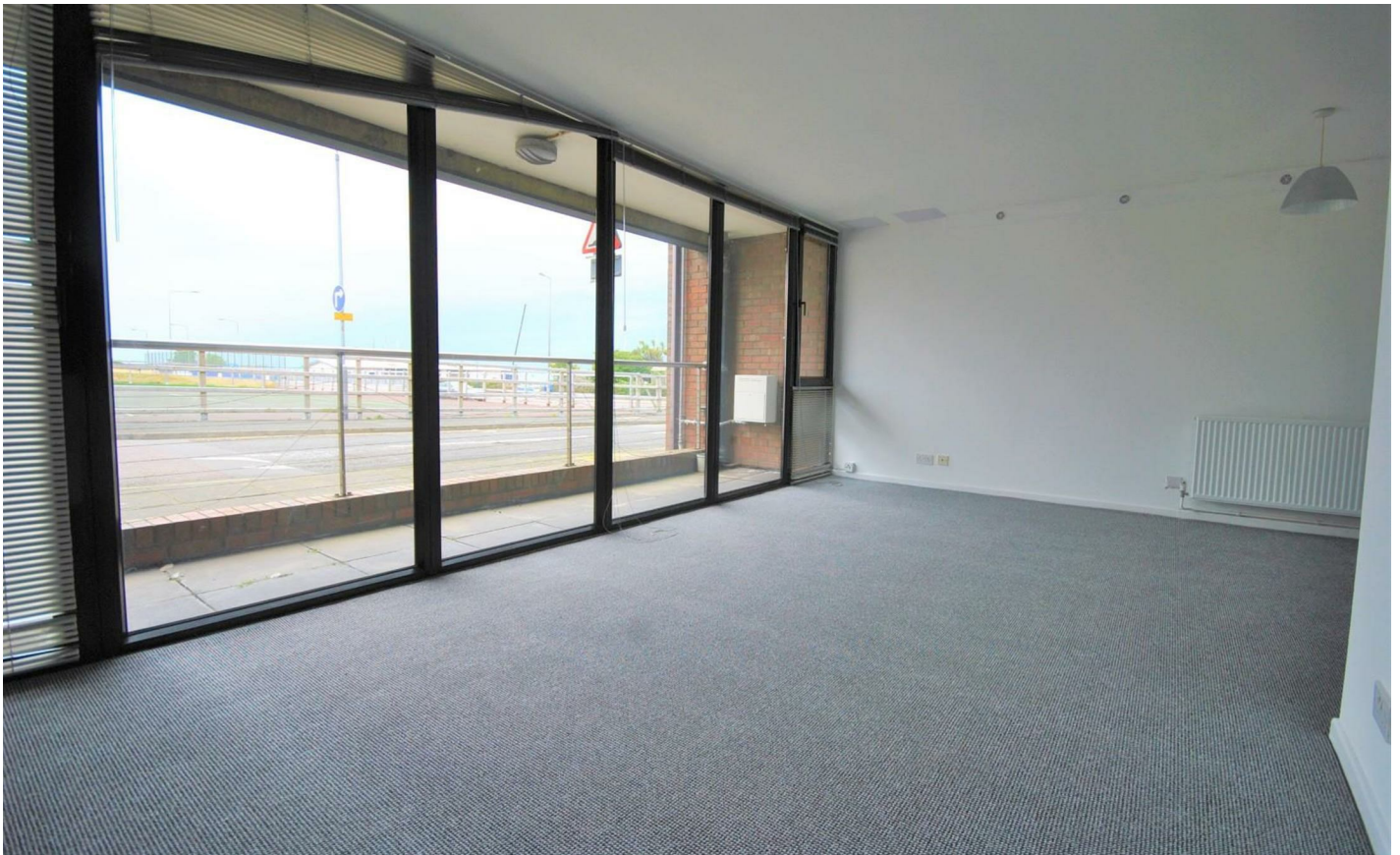
TYPE ROOM NAME HERE

Ballyholme Beach, Royal Ulster Yacht Club & Ballyholme Yacht Club are only a short walk away, a private terrace with picturesque sea views further compliments the accommodation. This sought-after address will not stay vacant for long and early viewing is recommended.