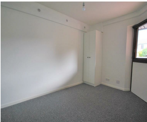
TYPE ROOM NAME HERE