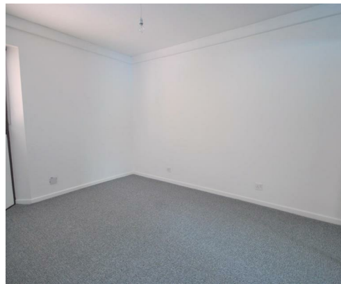
TYPE ROOM NAME HERE