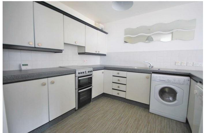
TYPE ROOM NAME HERE