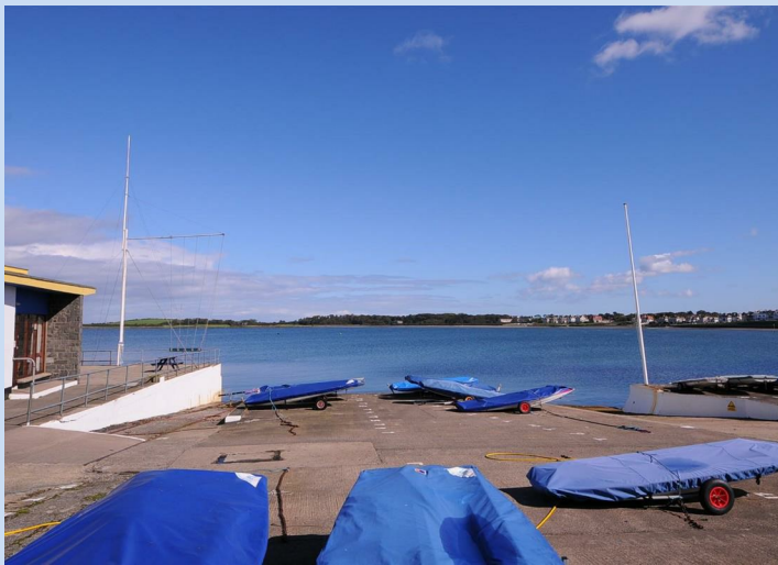
TYPE ROOM NAME HERE