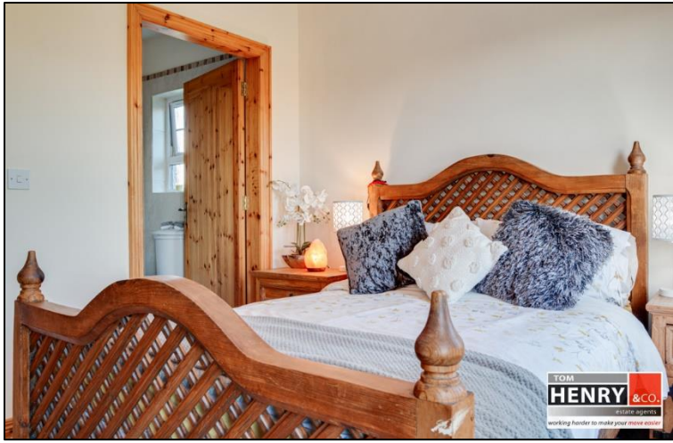
BEDROOM 2: TO FRONT. CARPET TO FLOOR. BUILT-IN STORAGE.