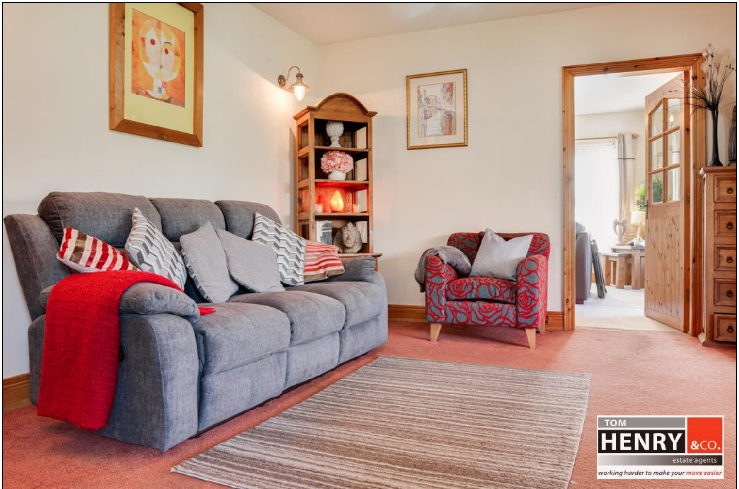
FORMAL DINING AREA: CURRENTLY USED AS A "SNUG". CARPET TO FLOOR. GEORGIAN GLAZED DOUBLE DOORS TO SUNROOM. ARCH TO KITCHEN.

TOM HENRY & CO. estate agents working harder to make your move easier