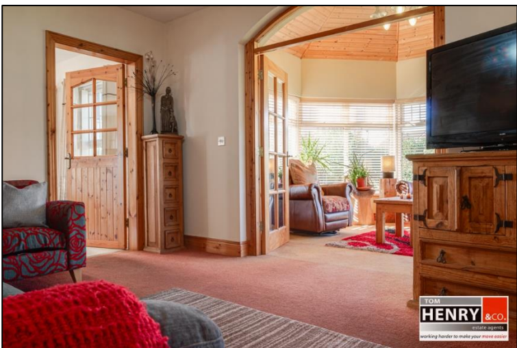
SUNROOM: CARPET TO FLOOR. TIMBER SEMI-VAULTED CEILING. FRENCH DOORS TO REAR GARDEN.