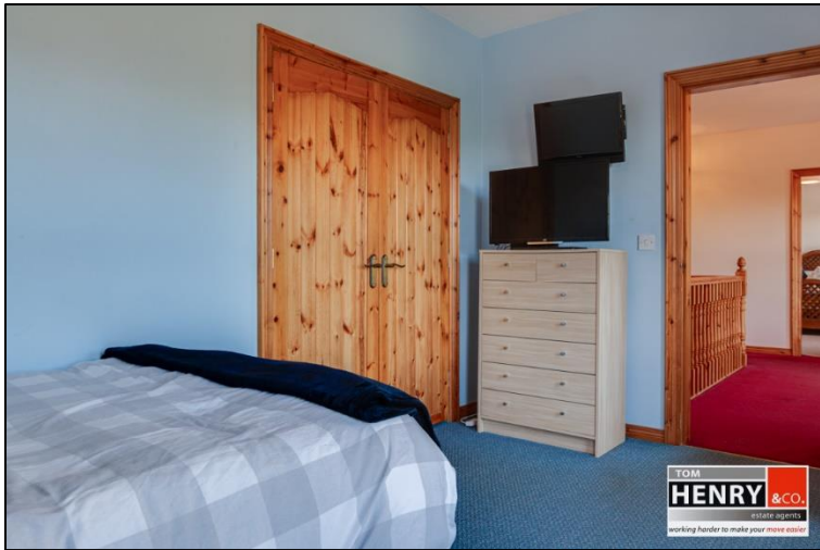
BEDROOM 3: TO REAR. CARPET TO FLOOR.