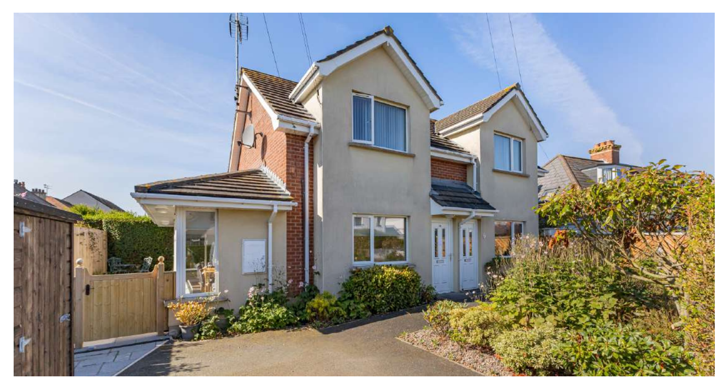
APARTMENT | 2 ⊨ | 1 ≒ | 1 ⊟

Accessed via its own front door this fantastic ground floor apartment is conveniently positioned right in the heart of the popular village of Ballyholme.