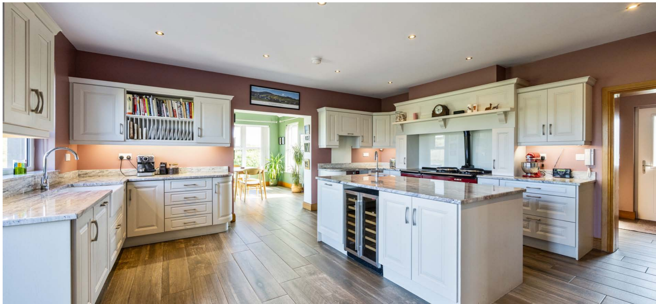
Luxury fitted kitchen