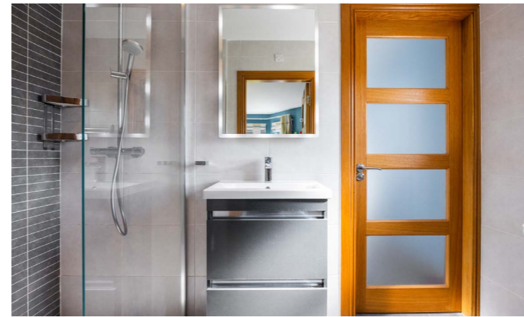
Ensuite shower room

14' 7" x 9' 5" (4.44m x 2.87m) Luxury suite comprising free standing bath with mixer tap and telephone shower, RAK wall mounted sink unit, Geribet flush system, wall mounted sink unit with mixer tap and cabinet below, heated towel radiator, large double shower cubicle with thermostatically controlled shower unit, over drencher and telephone shower, fully tiled walls, wood effect tiled floor.