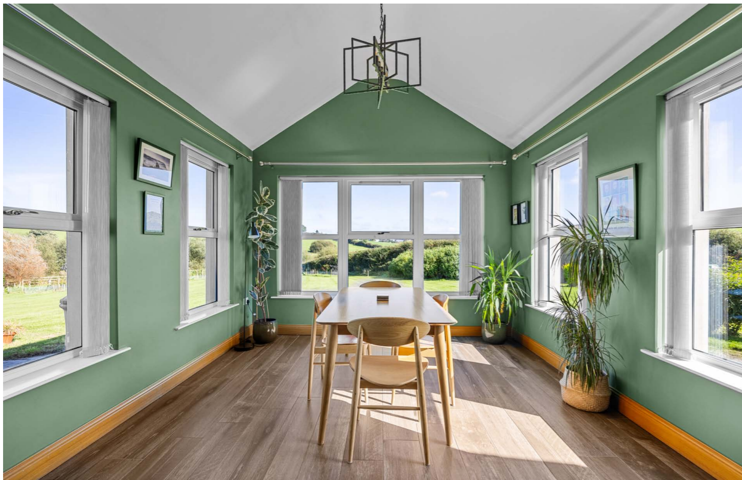
Casual dining & sitting area