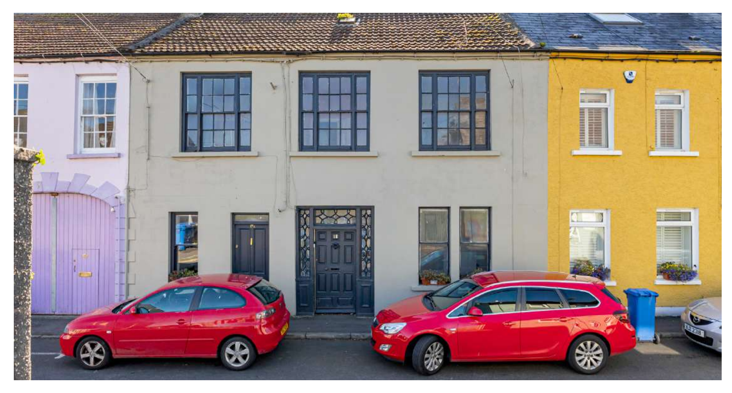
MID TERRACE | 4 \models | 1 \oint | 1 \bigoplus

Conveniently positioned within the heart of Donaghadee's thriving town centre this is an excellent opportunity to purchase a substantial mid terrace property offering huge potential and a wealth of accommodation.