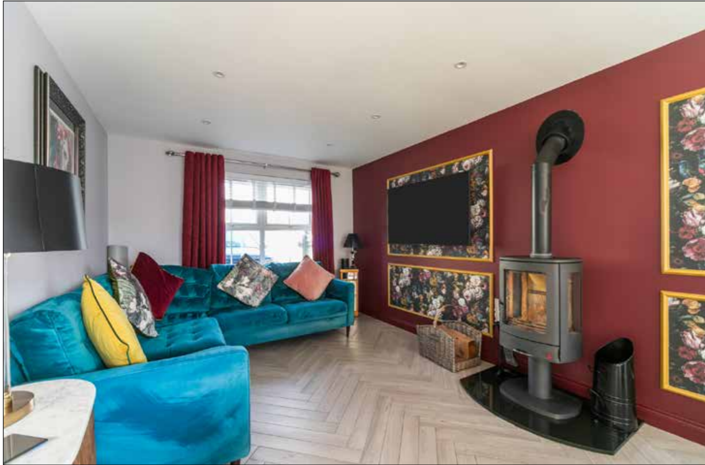
LIVING ROOM: 20' 5" x 10' 5" (6.22m x 3.18m) Wood Burning Stove