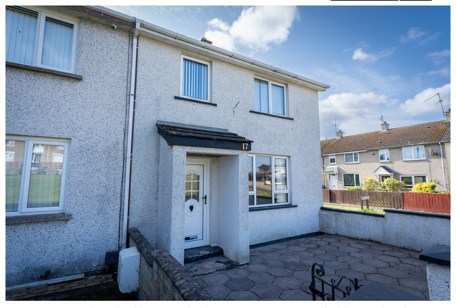
Spacious three bedroom end of terrace property, in a highly sought after location