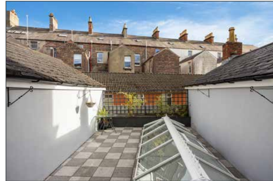
BALCONY: 25' 5" x 12' 5" (7.75m x 3.78m) Paved patio around roof lantern.