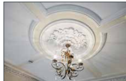
BEDROOM (1): 25' 8" x 16' 4" (7.82m x 4.98m) Cast iron fireplace with marble surround, corniced ceiling, coffered ceiling, shuttered windows.