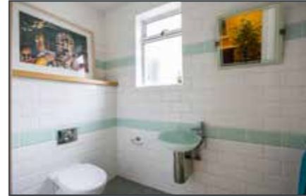
CLOAKROOM: Low flush WC, vanity sink unit, ceramic tiled floor, fully tiled walls, chrome towel radiator.