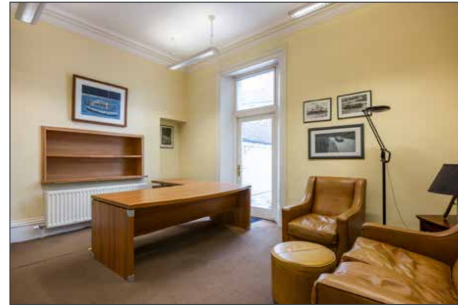
BEDROOM (2): 17' 6" x 13' 6" (5.33m x 4.11m) French double doors to balcony, French door to WC.