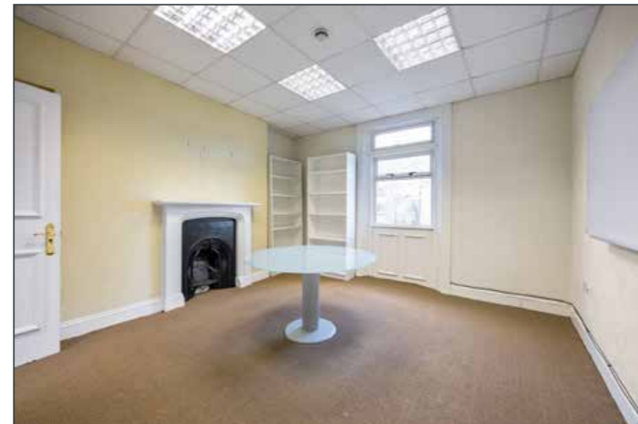
BEDROOM (3): 17' 4" x 12' 8" (5.28m x 3.86m) Suspended ceiling.