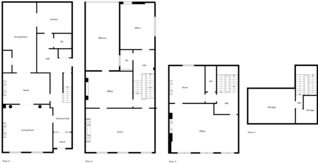
Floorplan Is For Illustrative Purposes Only And Is Not To Scale