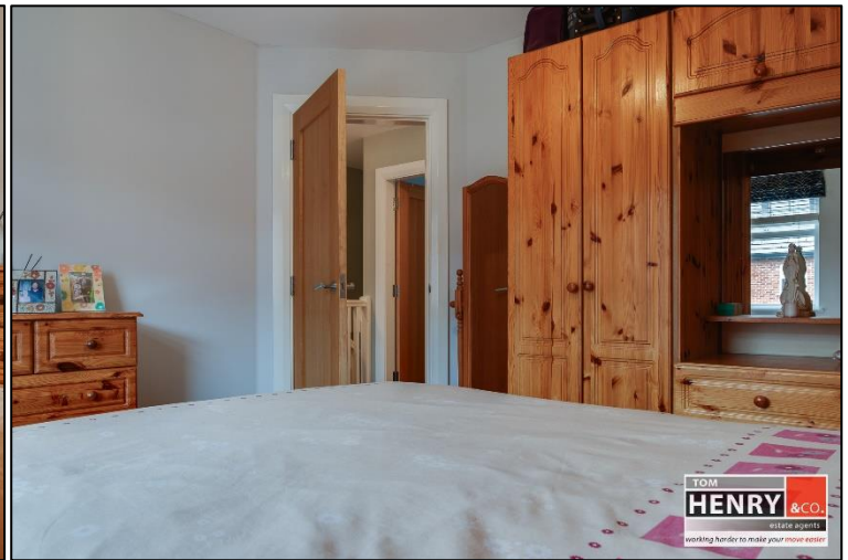
BEDROOM 3: TO REAR. PRE-FINISHED FLOOR.