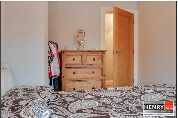
BEDROOM 2: TO REAR. PRE-FINISHED FLOOR.