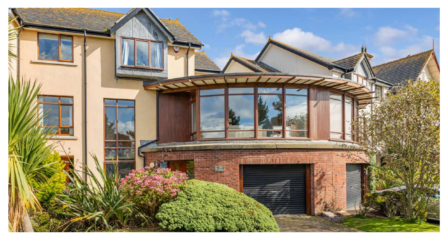
TOWNHOUSE | 4 ⊨ | 1 ≒ | 3 ⊟

Cove Bay is ideally situated in the delightful coastal village of Groomport which has quickly become a well established residential development. Number 21 hosts a wealth of accommodation set over three floors.