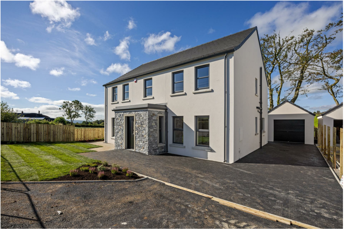
Site 1 88-90 Ballynashee Road, Ballyclare, BT39 9TG