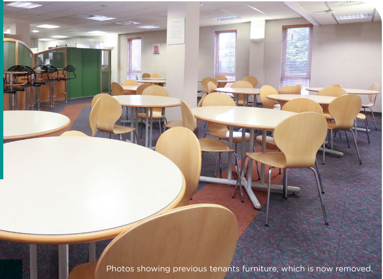
Photos showing previous tenants furniture, which is now removed.

Forecourt parking for 8no. cars together with a large basement providing parking for a further 18no. cars.