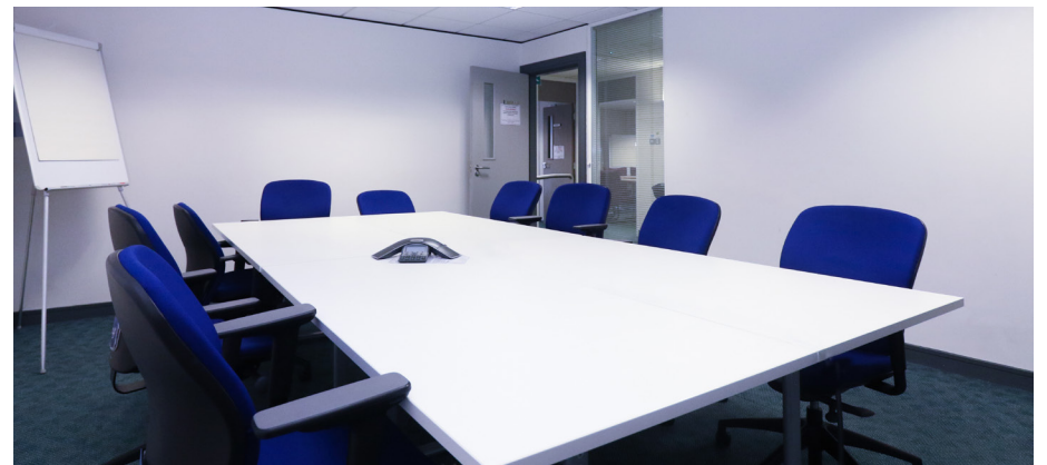
Photos showing previous tenants furniture, which is now removed.