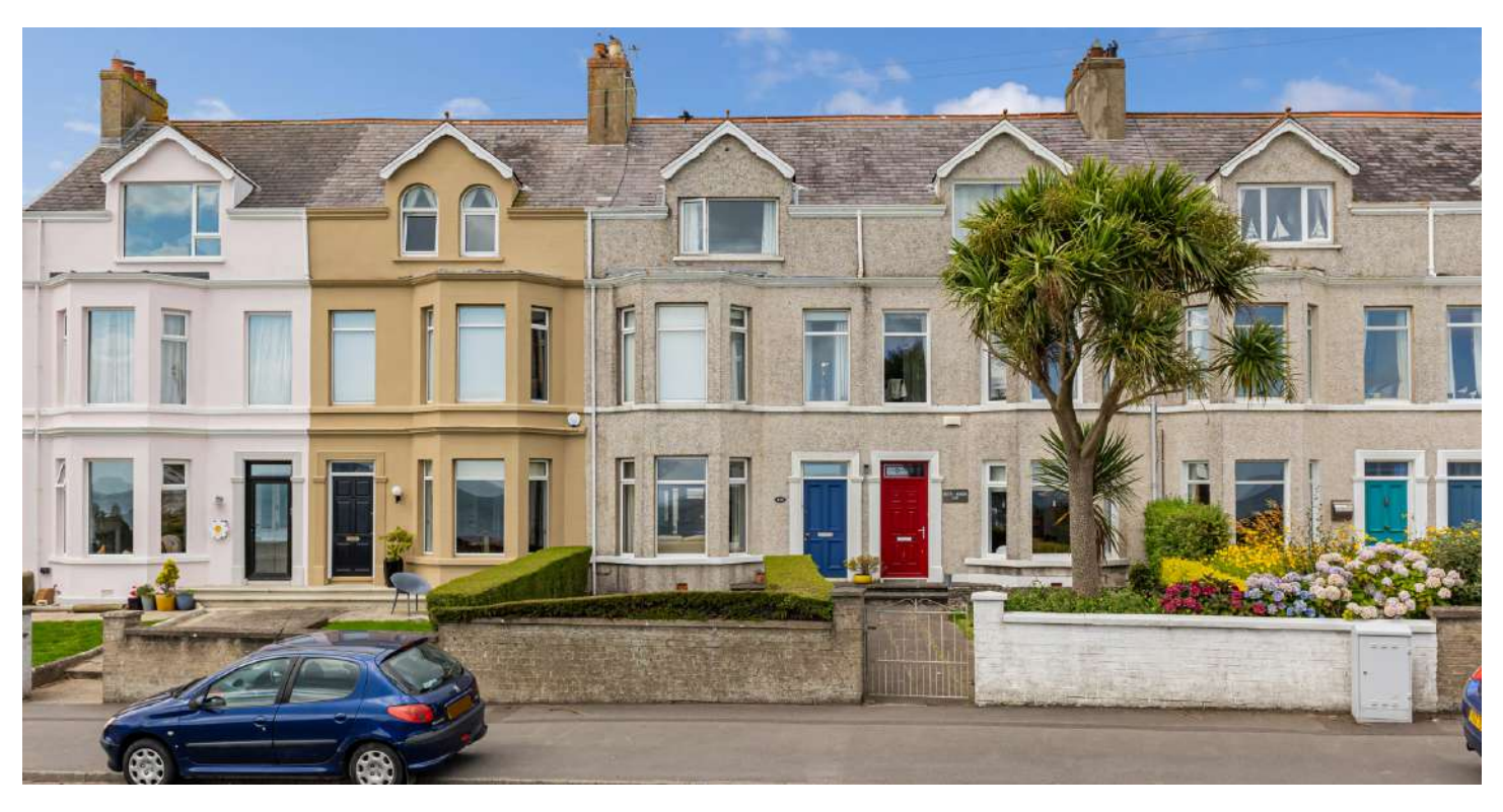
MID TERRACE | 4 ⊨ | 1 ≒ | 2 ⊟

Here is an ideal opportunity to purchase a substantial mid terrace property with stunning views over the Irish Sea and beyond to Scotland. The property is well presented throughout.