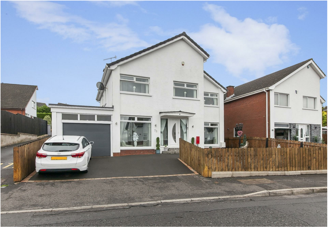
73 Ballyduff Road, Newtownabbey, BT36 6UT