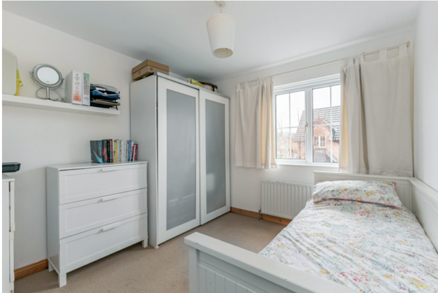
BEDROOM (3): 9' 3" x 8' 5" (2.82m x 2.57m)