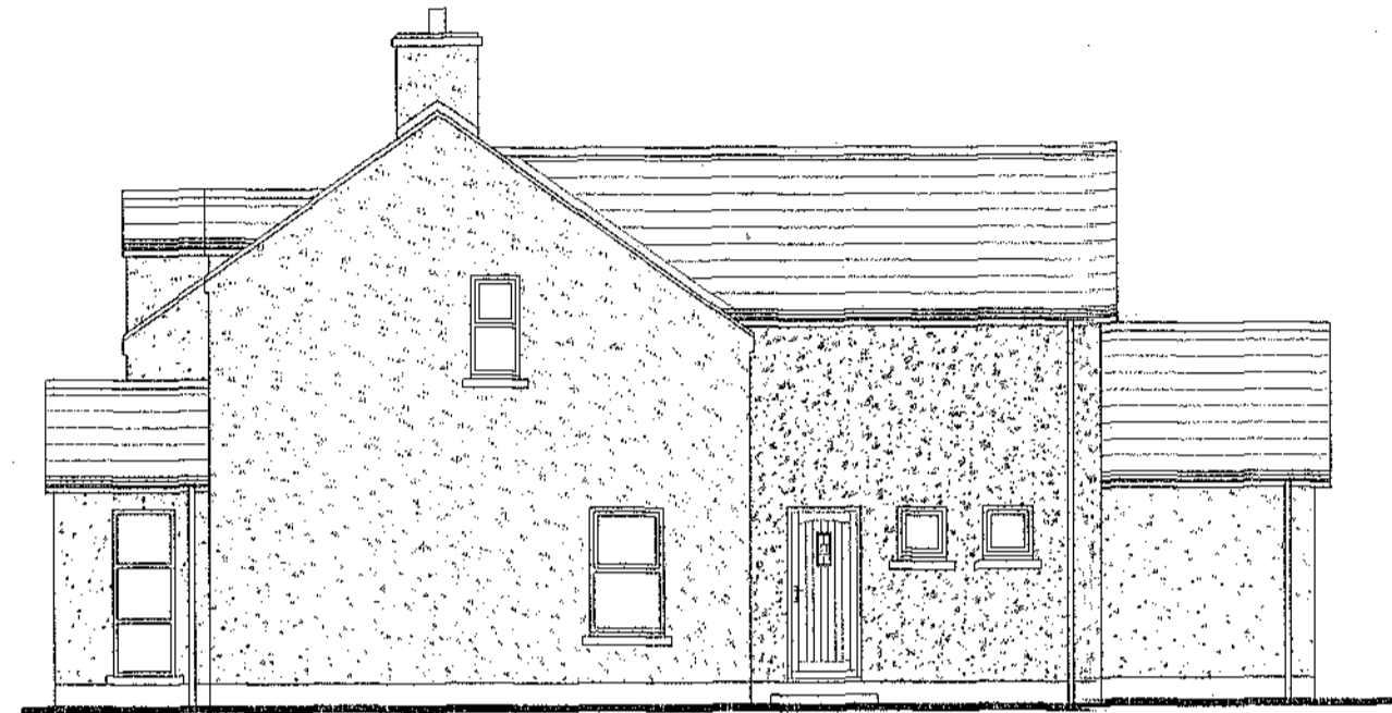
6A&B ELEVATION (1:100)

Roofs - Flat Non-Profiled Concrete Tiles - Colour Blue / Black Walls - Roughcast Render Finish Smooth Rendered Plinth Windows - Black Aluminium Double Glazed Units Cills - 100mm Faced Concrete Cills Doors Hardwood Painted Cluttering - Black uPVC