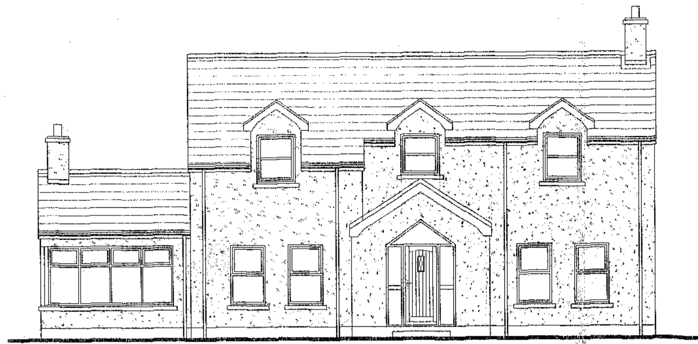
FRONT ELEVATION (1:100)