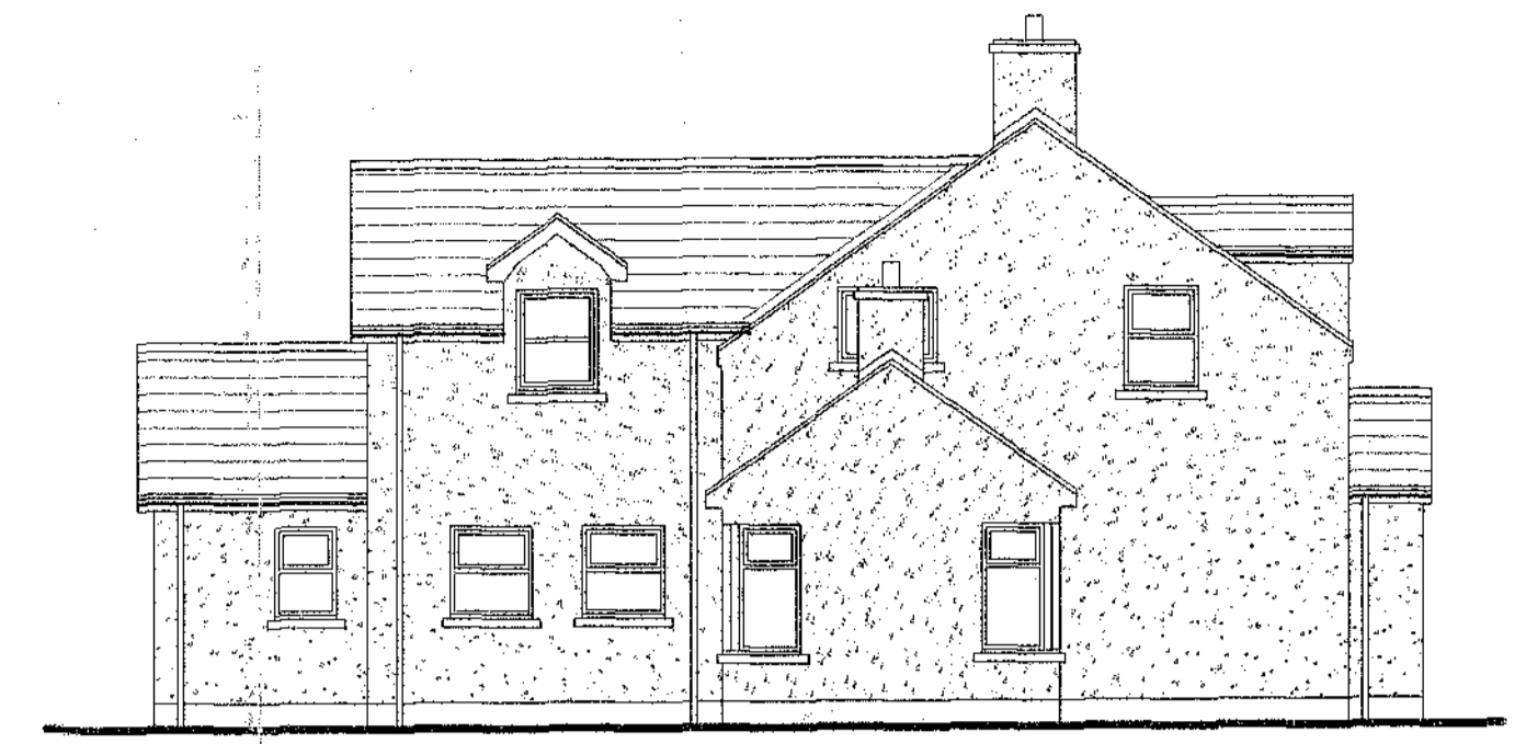
6A&B ELEVATION (1:100)