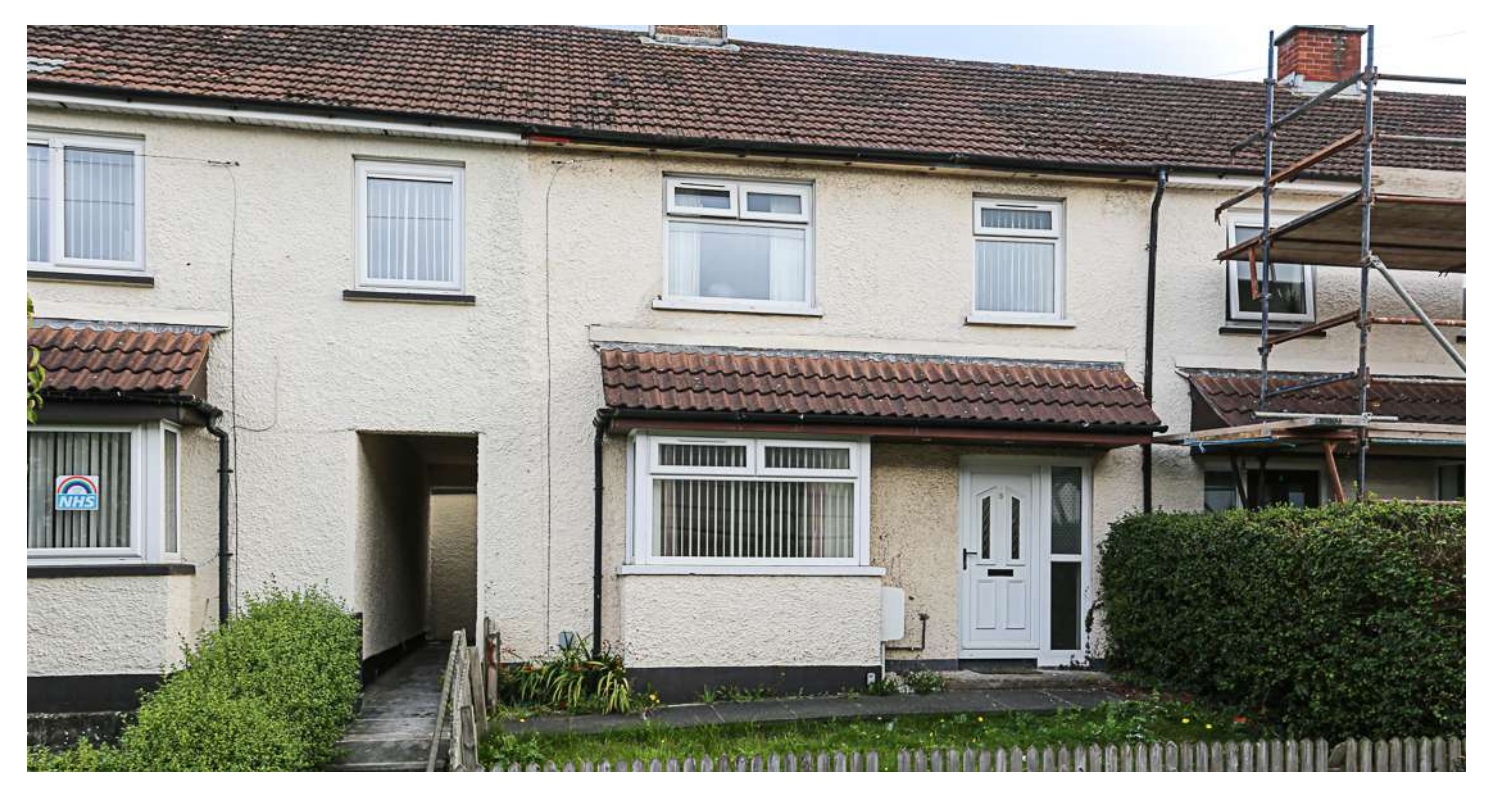
MID-TERRACE | 3 ⊨ | 1 ≒ | 1 ⊟

This three-bedroom mid-terrace home at 6 West Link is sure to appeal to a wide range of purchasers, from first-time buyers to investors and families alike, and is expected to generate significant interest.