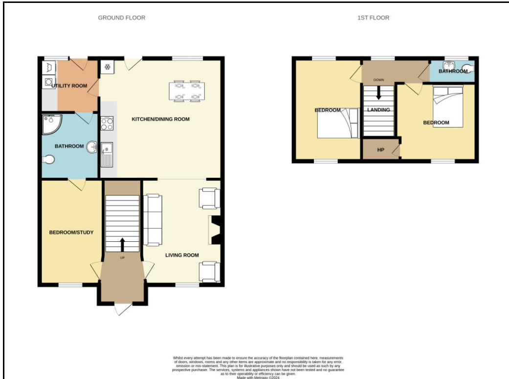
For illustrative purposes only. Not to scale