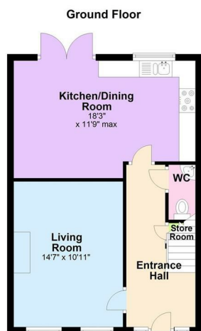
22 Magheraknock Park, Ballynahinch

Terms & Conditions: Please note that these particulars do not constitute an offer or contract of sale. Any prospective purchaser should satisfy themselves by thorough inspection of the property and we recommend that any prospective purchaser should employ the professional services of a building surveyor and consider their findings prior to entering into contract. All such fees associated with this work will be the responsibility of the prospective purchaser regardless of whether the sale completes or not. In addition, none of the appliances or installations have been tested in any way whatsoever and it is our recommendation that a purchaser should fully satisfy themselves by employing an appropriate expert. We would also like to advise that our measurements are taken from the widest points of each room and should not be relied upon as completely accurate. You should not make decisions based on the measurements provided and double check measurements at all times. Valuation/Mortgage Service: As part of our service we would remind Vendors and potential purchasers that we have a Mortgage Broker available at this branch. If you are thinking of selling, we would be happy to carry out a free market appraisal of your property.