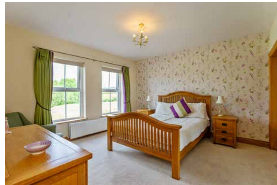
BEDROOM: 16' 0" x 12' 3" (4.88m x 3.73m)