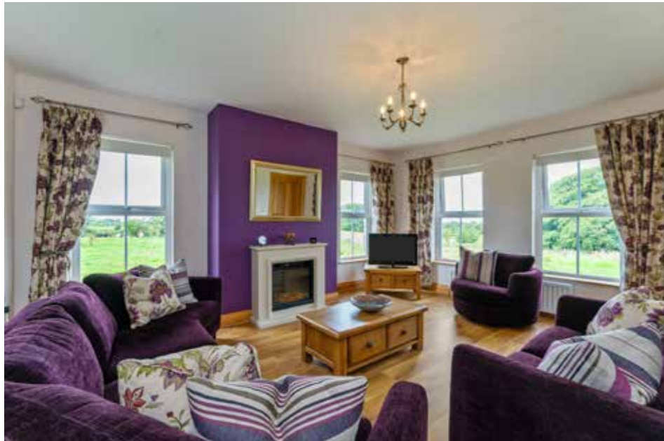
SUNROOM: 16' 0" x 15' 4" (4.88m x 4.67m)