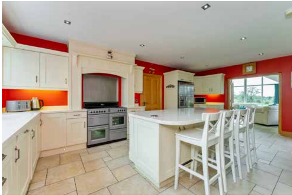
KITCHEN/DINING: 22' 6" x 18' 0" (6.86m x 5.49m)

Kitchen - range of high and low level units, central island, corean worktops, recess for range cooker and fridge freezer, integrated dishwasher and wine fridge, tiled floor