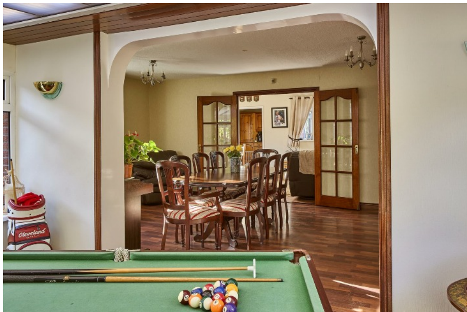
SUN ROOM: 14' 1" x 9' 2" (4.3m x 2.8m) uPVC double glazed patio doors to gardens.