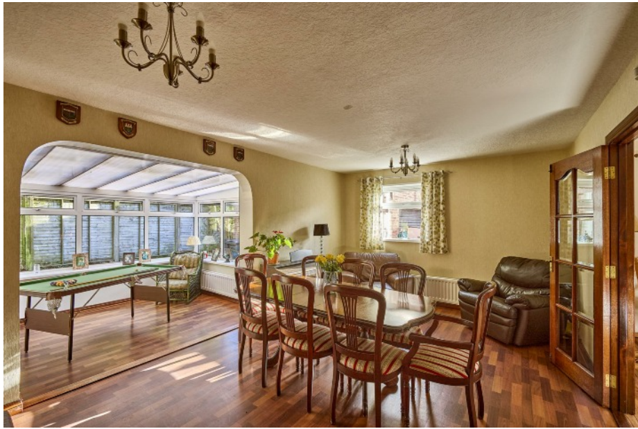
DINING ROOM: 19' 0" x 10' 10" (5.8m x 3.3m) Laminate wooden flooring.