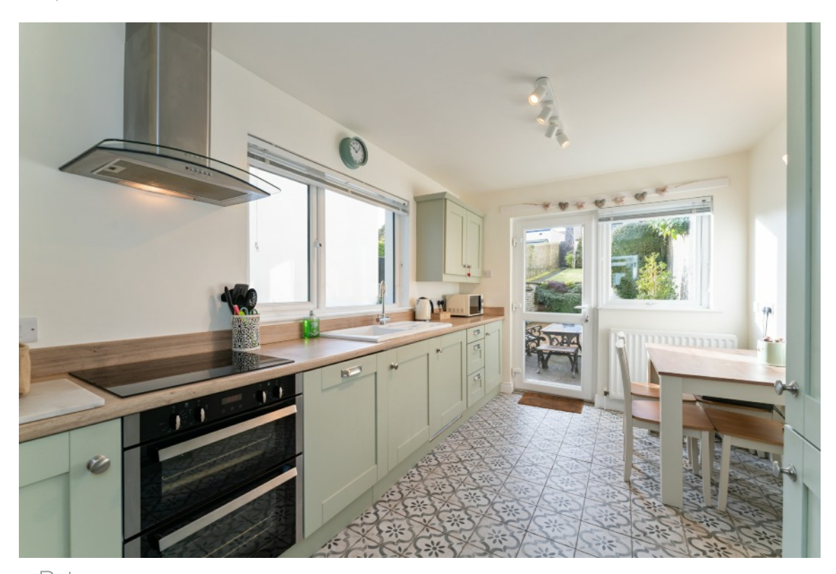
First Floor Return

MODERN FITTED KITCHEN WITH BREAKFAST AREA: 12' 6" x 8' 10" (3.8m x 2.7m) Excellent range of high and low level units, wood effect laminate worktops, porcelain sink unit with mixer tap, built-in double oven and four ring induction hob, stainless steel extractor fan, integrated fridge freezer, built-in dishwasher, ceramic tiled floor, space for 4 seater dining table, PVC glazed door to rear patio.