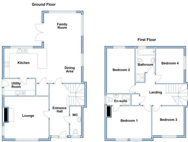
Please note this floor plan is for marketing purposes only, is not to scale and is to be used as a guide only. No liability is accepted in respect of any consequential loss arising from the use of this plan. Plan produced using PlanUp.