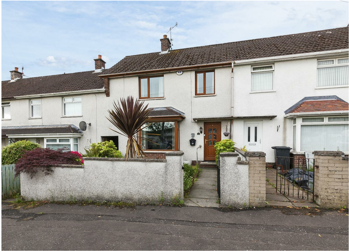
39 Kinbayne Crescent, Greenisland, BT38 8SX