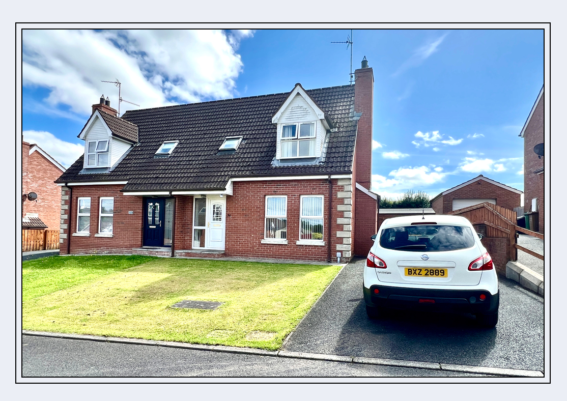
34 Laurel Drive, Laurelvale, Co Armagh BT62 2PP