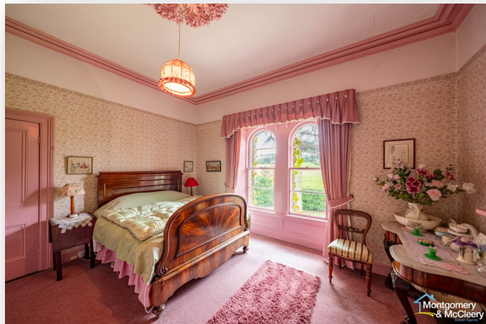
Full of natural light