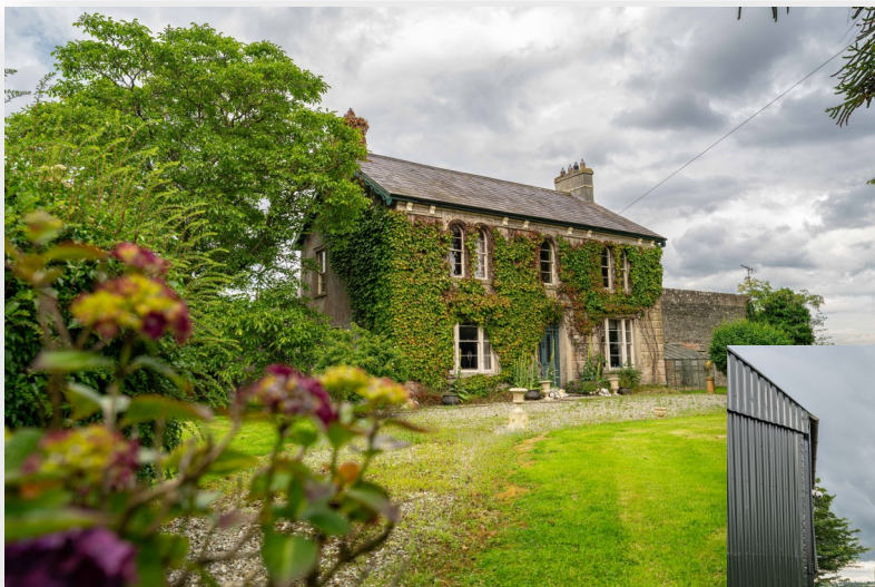
Gresteel House in all its glory.

Elegance and space are in abundance. Known as Gresteel House, one could consider this as one of the finest residences in the area.