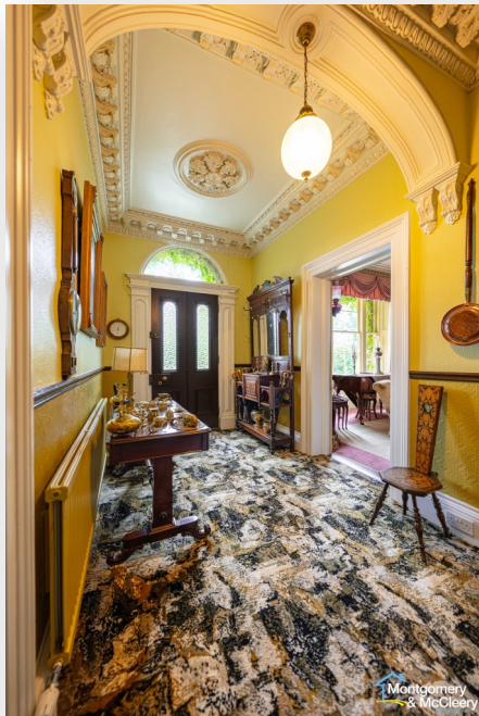
Original features line the entrance hallway