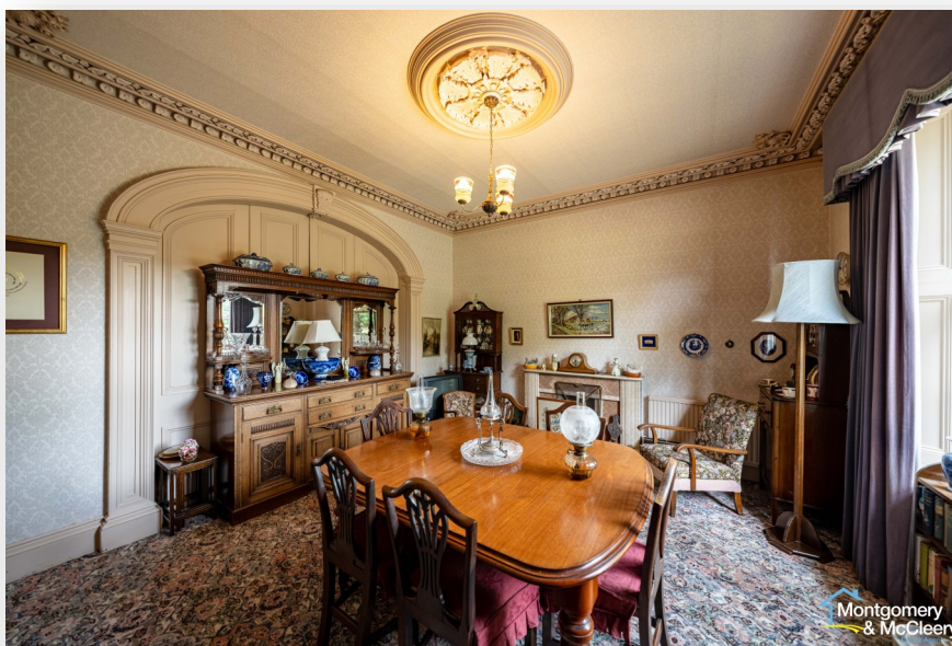
Fine dining for family and friends with room to spare

Whilst every care is taken in compiling this information we can give no guarantee as to the accuracy thereof and inquirers are recommended to satisfy themselves regarding these details which are given on the understanding that they do not form part of any contract.