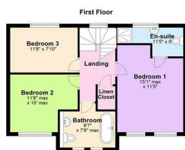
41 Lord Moira Park, Ballynahinch

Terms & Conditions: Please note that these particulars do not constitute an offer or contract of sale. Any prospective purchaser should satisfy themselves by thorough inspection of the property and we recommend that any prospective purchaser should employ the professional services of a building surveyor and consider their findings prior to entering into contract. All such fees associated with this work will be the responsibility of the prospective purchaser regardless of whether the sale completes or not. In addition, none of the appliances or installations have been tested in any way whatsoever and it is our recommendation that a purchaser should fully satisfy themselves by employing an appropriate expert. We would also like to advise that our measurements are taken from the widest points of each room and should not be relied upon as completely accurate. You should not make decisions based on the measurements provided and double check measurements at all times. Valuation/Mortgage Service: As part of our service we would remind Vendors and potential purchasers that we have a Mortgage Broker available at this branch. If you are thinking of selling, we would be happy to carry out a free market appraisal of your property.