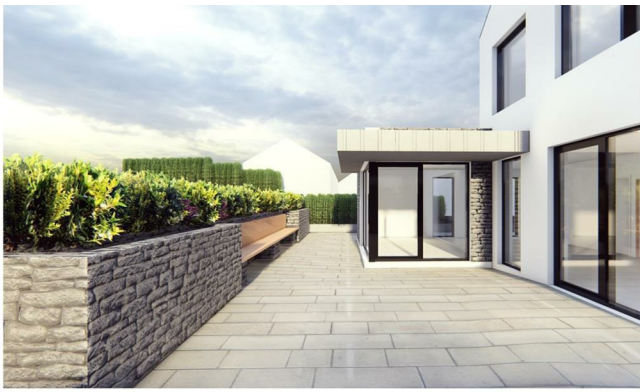
13 CARRICKMANNON ROAD - PATIO