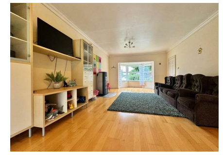
80 Rosses Farm Sourhill Road, Ballymena, BT42 2SH