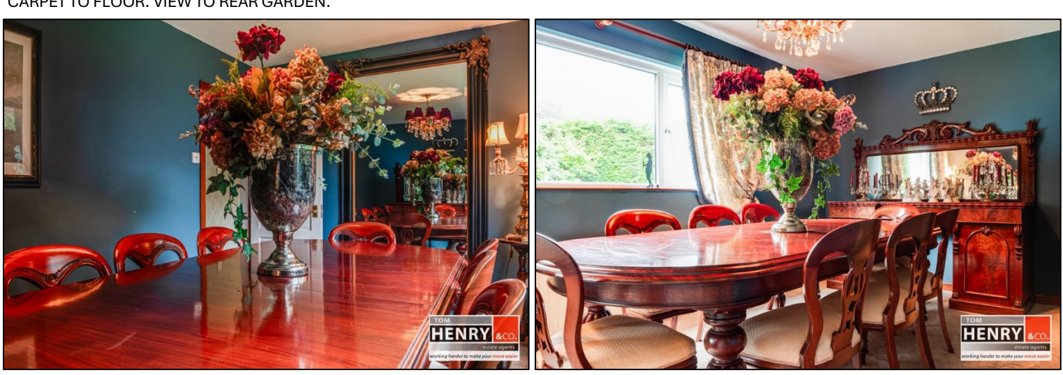
CARPET TO FLOOR. VIEW TO REAR GARDEN.