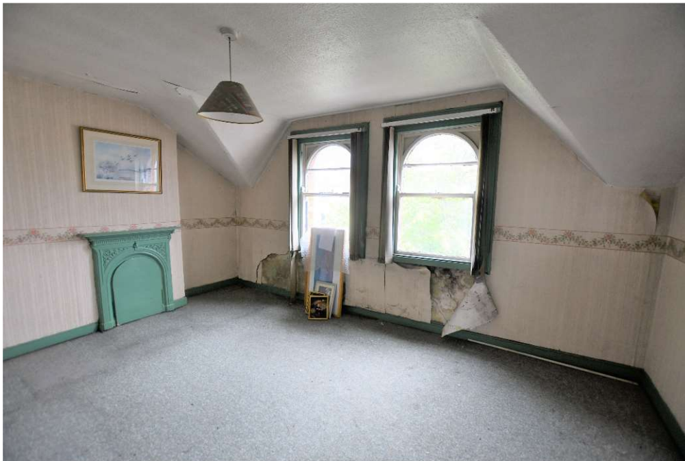
ATTIC ROOM 2: