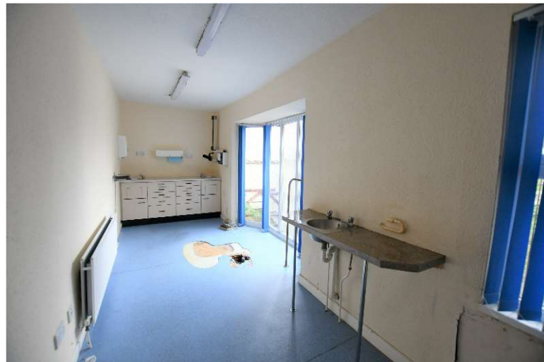
OFFICE/SURGERY AREA 3: 19'0" x 7'7" bay window. Separate low flush w.c.