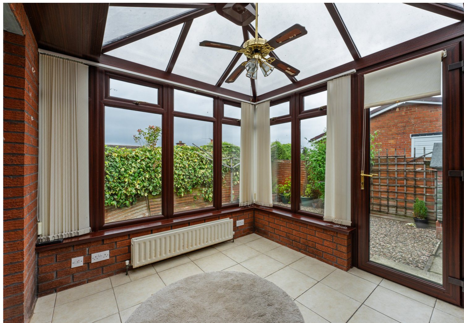
Double glazed conservatory