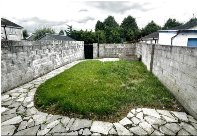
Walled in front & rear garden, with parking for 1-2 cars.