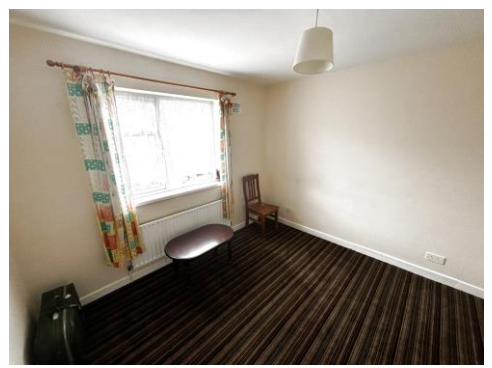
Bedrooms 1, 2 & 3