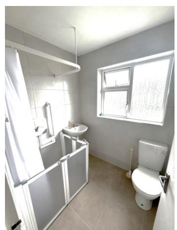
Landing and Bathroom