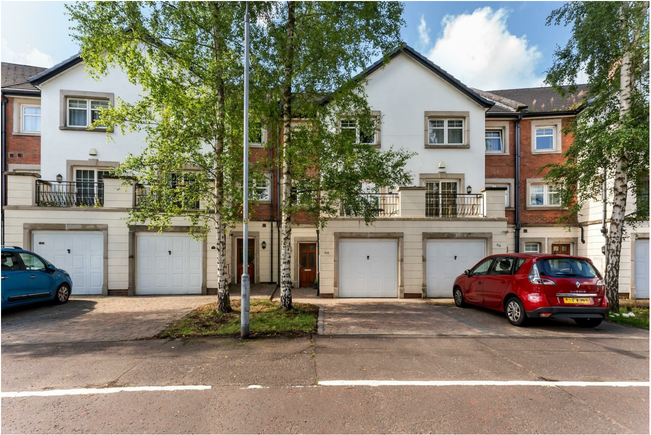
64 Beech Heights, Wellington Square, Belfast, BT7 3LQ