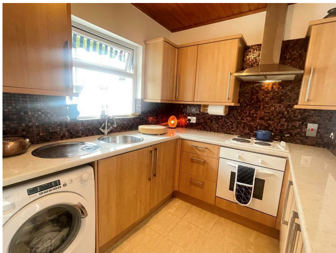
Range of high and low level units, plumbed for washing machine, integrated 4 ring electric hob and oven, extractor fan, stainless steel sink unit with drainer and part tiled walls and tiled floor.