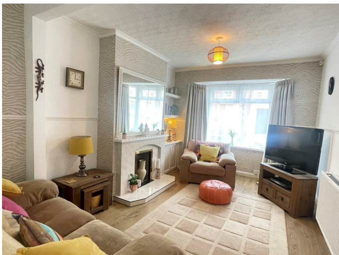
Laminate floor. Open fire