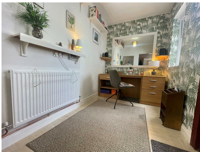
Tiled floor. Access to rear yard.