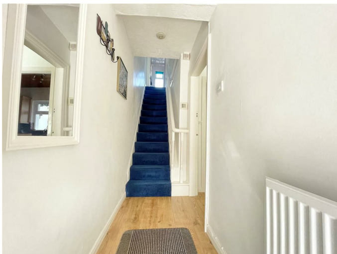
PVC Front Door. Laminate flooring