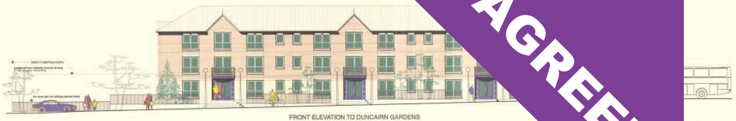
FRONT ELEVATION TO DUNCAIRN GARDENS