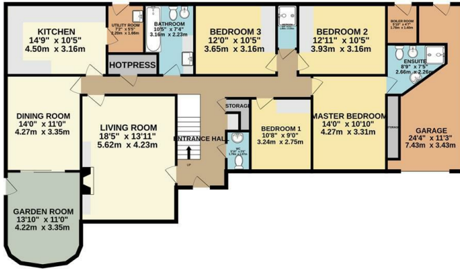
GROUND FLOOR 1885 sq.ft. (175.1 sq.m.) approx.