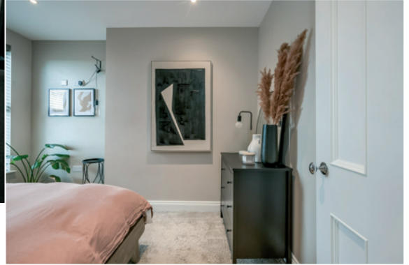
BEDROOM (2): 10' 9" x 10' 4" (3.28m x 3.15m)