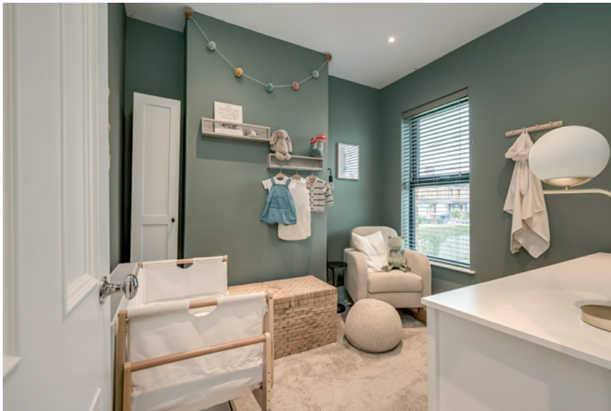
BEDROOM (3): 8' 7" x 8' 3" (2.62m x 2.51m)