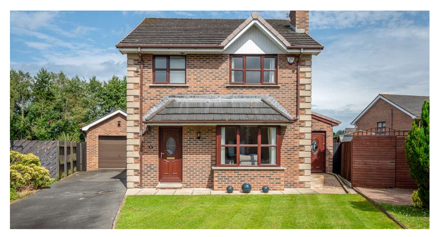
DETACHED | 4 ⊨ | 3 ≒ | 3 ⊟

Tucked away at the end of a quiet cul-de-sac within this popular residential area here is an ideal opportunity to purchase an attractive extended detached family home.