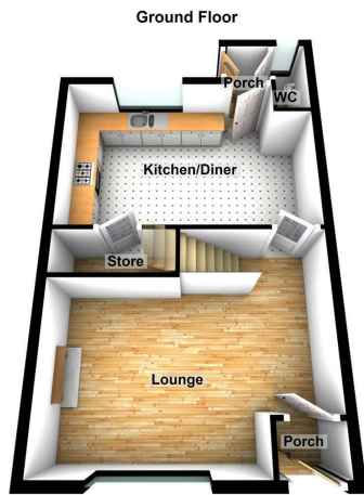
Images for illustrative purposes only and subject to change. Plan produced using PlanUp.