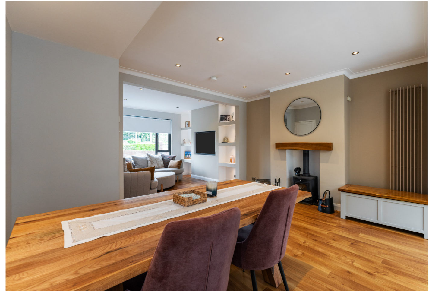
Dining area open to family room