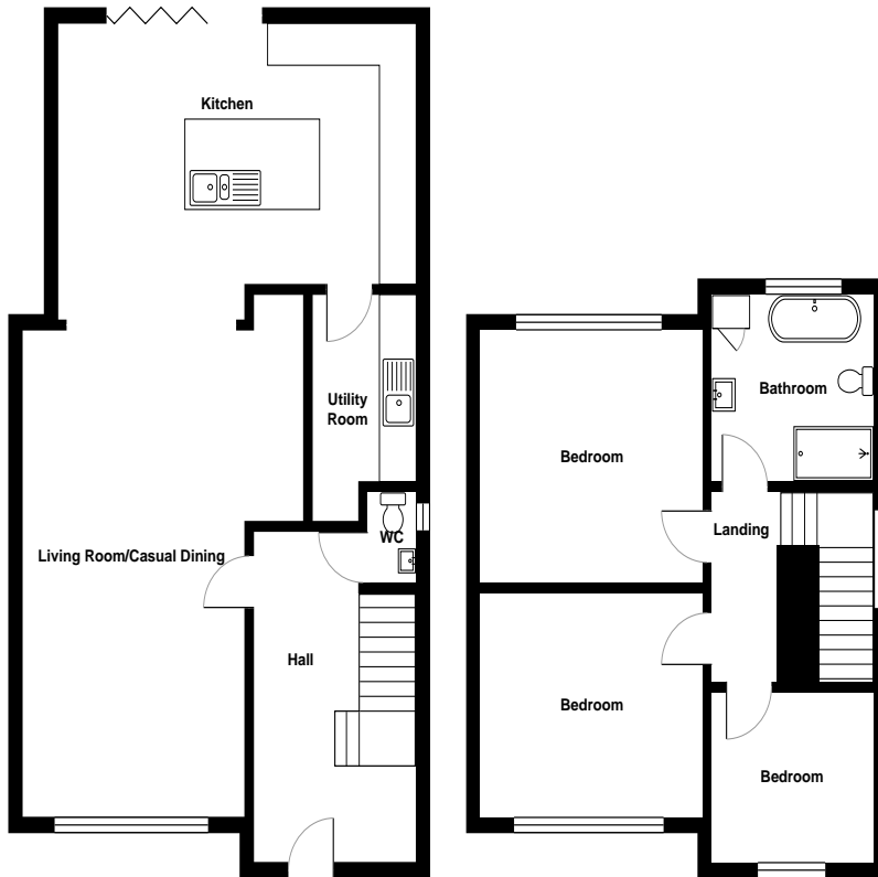
Total Area: 124.8 m 2 ... 1344 ft 2 All measurements are approximate and for display purposes only