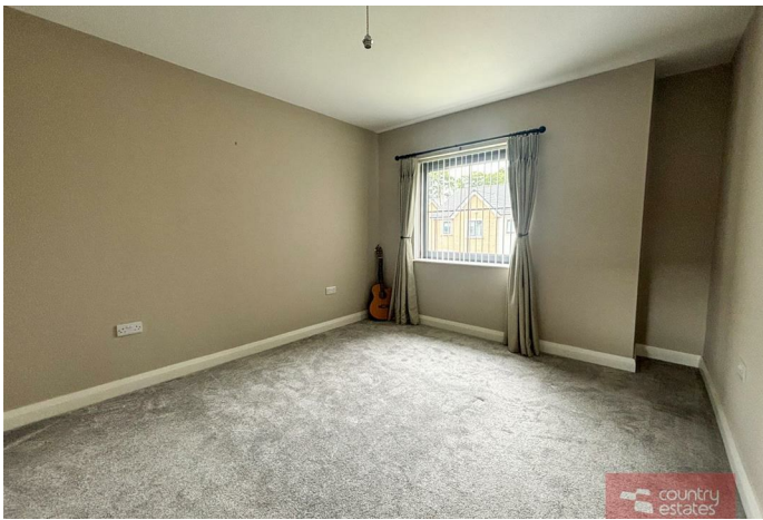
BEDROOM 3 9'9" x 7'4"