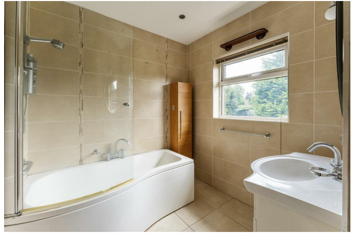
Modern suite comprising panel bath with electric shower over, wash hand basin with storage below, tiled walls, tiled floor.