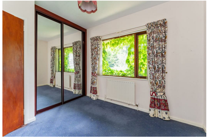
Built in sliding robes.