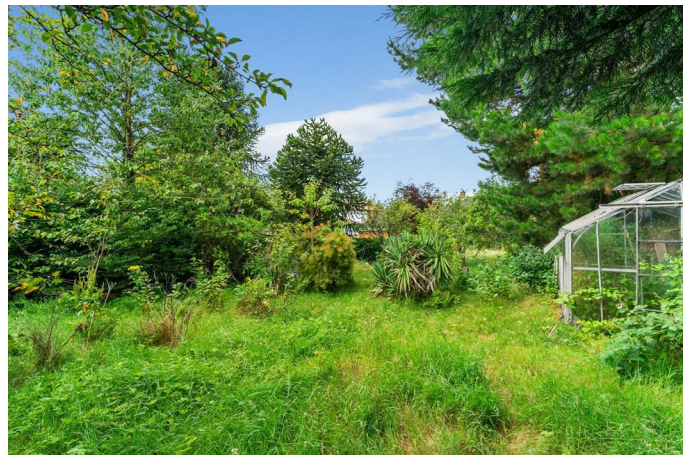
An excellent garden to rear in lawn, front garden, driveway and detached garage.