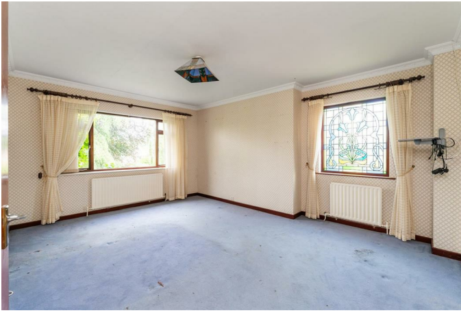
Stain glass window.