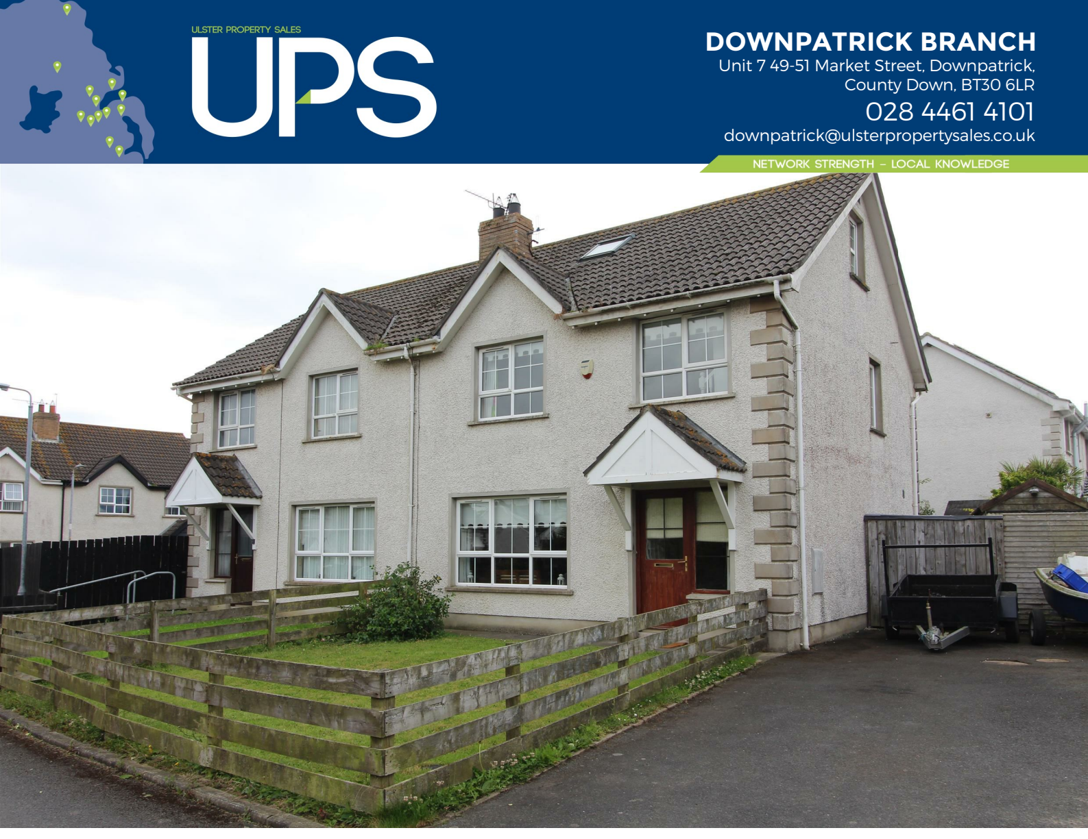
7 SEAVIEW, KILLOUGH, DOWNPATRICK, BT30 7PT