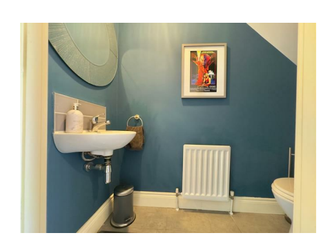
17 Wells Gate Carnmoney, Newtownabbey, BT36 6FR