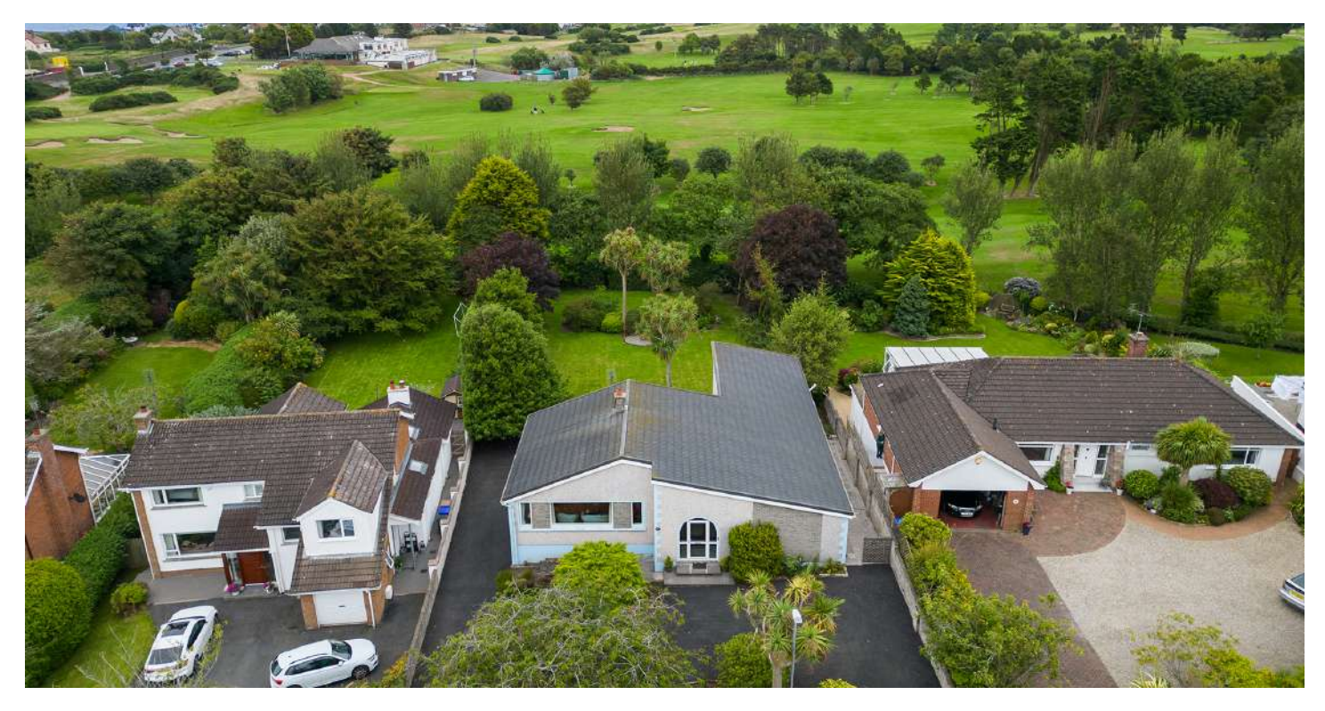
DETACHED | 4 ⊨ | 2 ≒ | 2+ ⊟

Ideally located, in the extremely popular and highly regarded residential area just off the prestigious Warren Road, this is an ideal opportunity to purchase an outstanding detached split level bungalow on an extensive site backing onto the