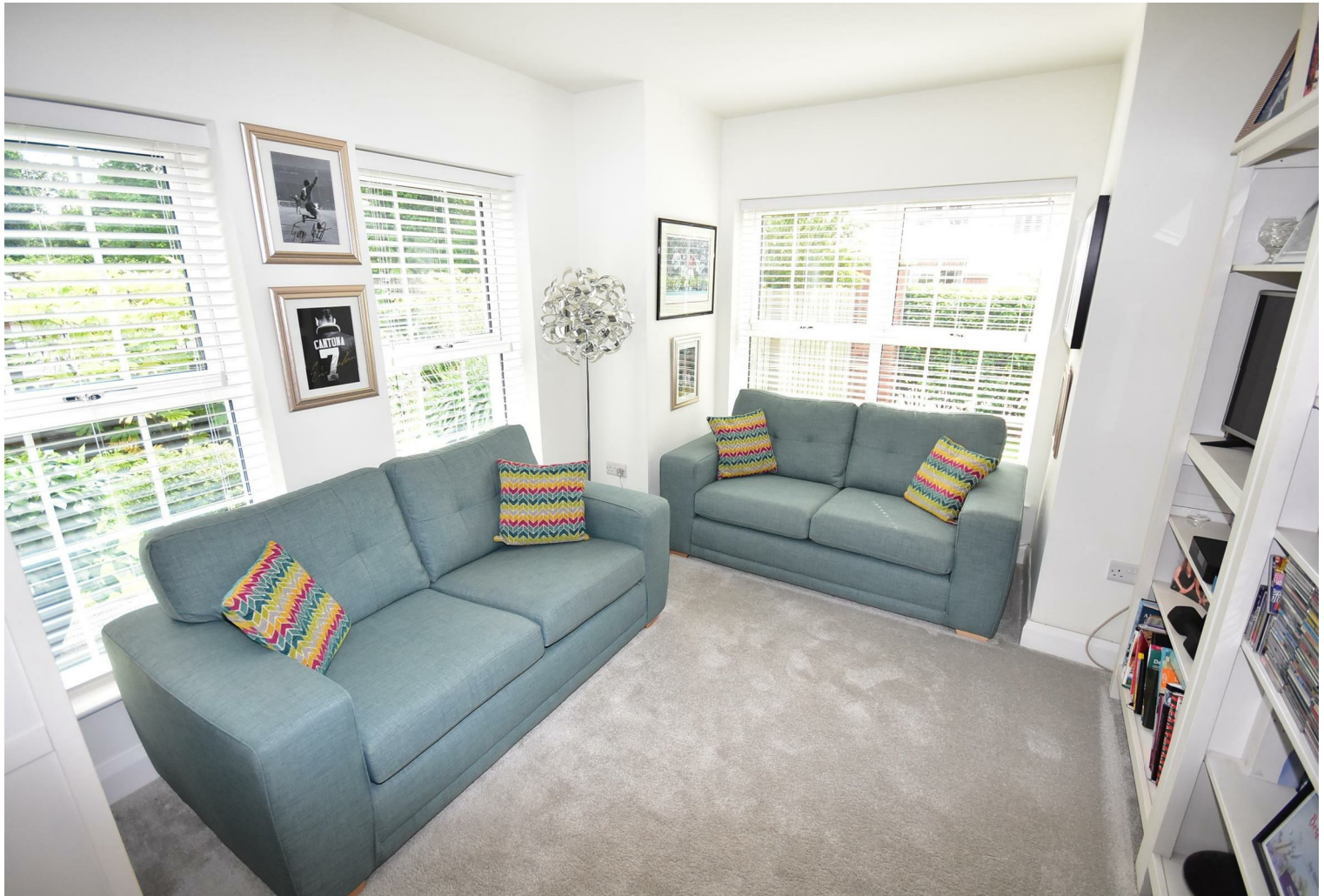
LIVING ROOM 12'8 x 10'2 (3.86m x 3.10m) (into bay) Dual aspect windows. Single radiator.