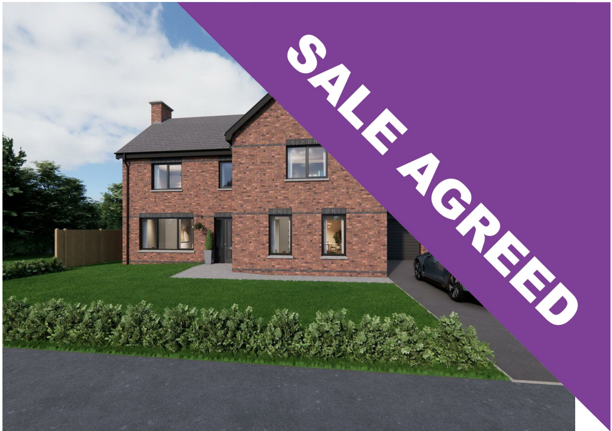
Site 67 The Mews, Jordanstown, Newtownabbey, BT37 0NQ